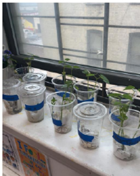
Invitation to explore: Children were invited to explore the plant life cycle by investigating how lima beans grow.