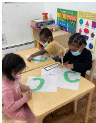
C is for Caterpillar! Our friends are busy tracing the letter C with glue to then put on pompoms to create caterpillars.